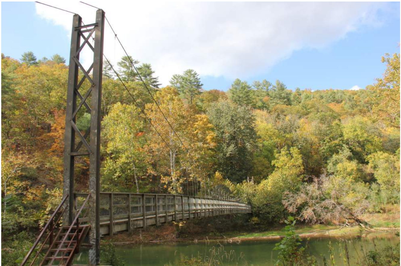
USFS GWNF Warm Springs Ranger District, Walton Tract Swinging Bridge

west side of the Cowpasture River for naturalists, photographers, birders, painters, fly fishermen, hunters, trappers, hikers, bicyclists and primitive campers. The Walton Tract is located five and a half miles south of Millboro Springs along Virginia State Route 42 and one and six tenths miles west along Virginia Route 632 or Grizer's Gap Road and then, Wallawhatoola Road. The woodlands and fields found along both sides of the Cowpasture River provide a diversity of wildlife habitats with wildflowers to enjoy in the spring and early summer while the River itself may be more directly experienced by canoe. Wildlife viewing opportunities for bird enthusiasts along the river banks include green and great blue herons, wood ducks, belted kingfishers, pileated woodpeckers, blue jays, American crows, white-eyed vireos, red-tailed hawks and turkey vultures. Reptile enthusiasts can enjoy spotting bullfrogs, eastern painted turtles, occasional northern water snakes and black rat snakes. Game species include black bear, whitetail deer, wild turkeys, rabbits, racoons, squirrels, muskellunge, perch and small mouth bass. The Walton Tract swinging bridge, most likely constructed in the late 1970s, spans 218 ½ feet across the Cowpasture River, features 32 feet tall steel I-beam towers and the pedestrian deck is 30 inches wide.