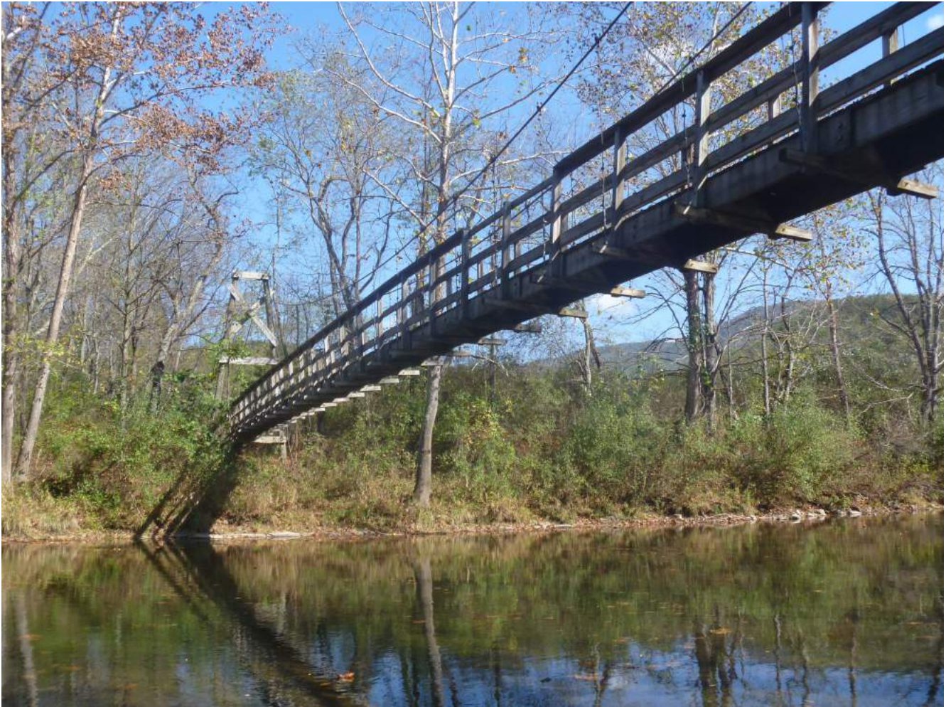
USFS GWNF North River Ranger District, Wallace Tract Swinging Bridge Demonstrating Classic Wooden Bridge Towers, Deck and Rails